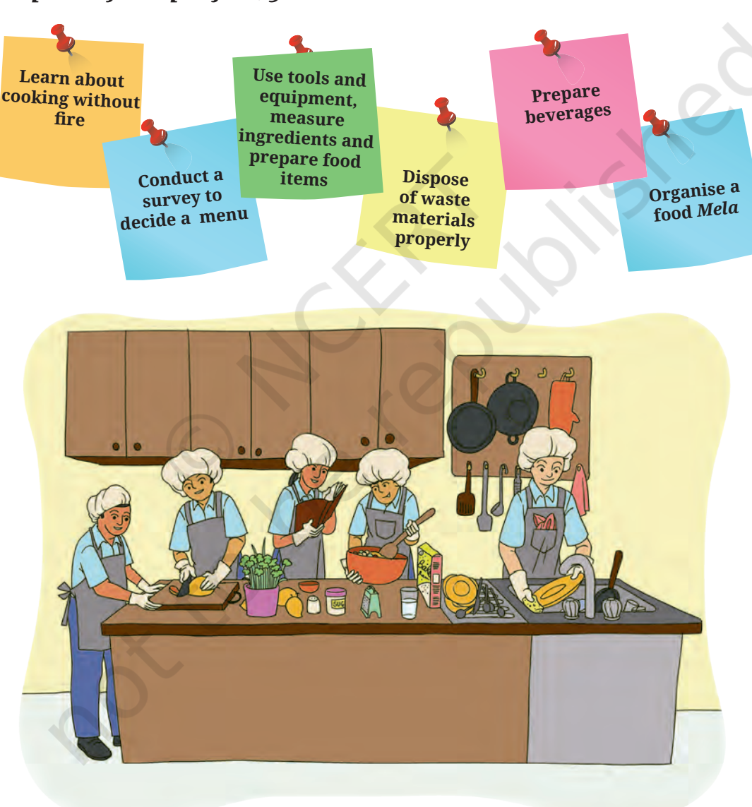
Figure 6.1: Working together in a kitchen